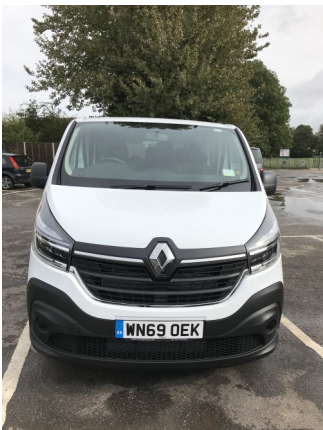
Photos: New Renault Master mini-bus