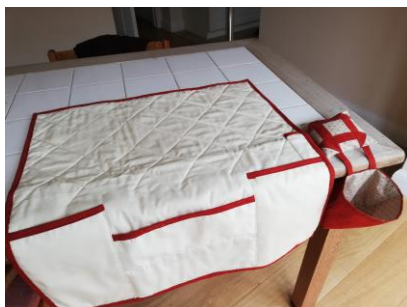
Machine mats & sew-tidies- £88