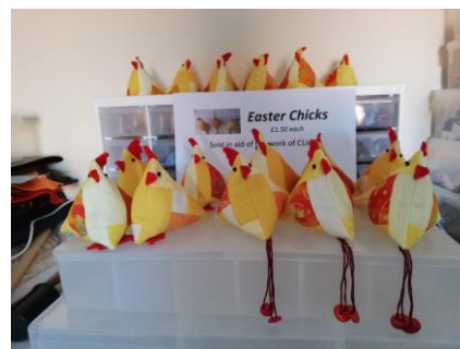
Easter chicks - £87