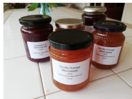
Marmalade and jams – £222