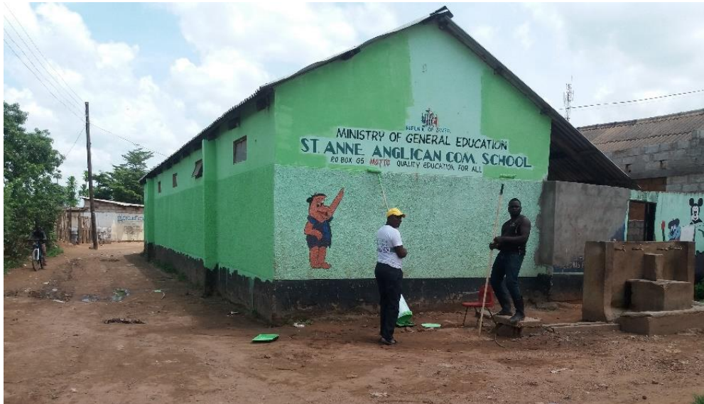
Painting St Anne's school during Christmas holidays

The charity 'Changing Lives in Chongwe' is in its 14 th year. It is what is known as a 'kitchen table' charity as it has no premises and most trustee meetings take place round the kitchen table! You will notice that I have moved to a new house but the kitchen table is still here and trustees still meet around it.