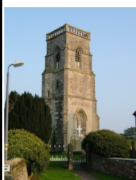
St Oswald's, Rockhampton

The last weekend of June will see events in Cromhall and Tytherington; the last weekend in September will see events based at Rockhampton and Falfield, and there will be events based at Tortworth in December – 14 th /15 th . Please do look out for information about these weekends and support “the churches in our villages”.