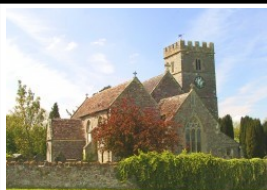
St Andrew's, Cromhall

2019 is going to be a year of three major events in the CRoFTT Benefice.