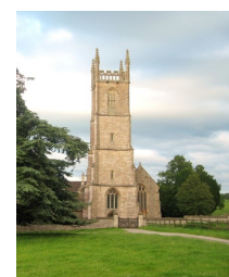
St Leonard's Tortworth