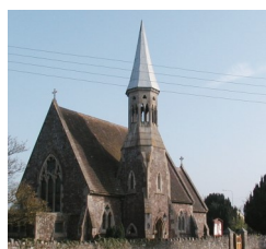
St George's, Falfield