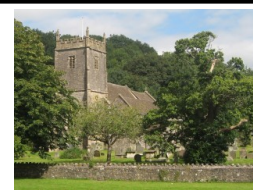
St James', Tytherington

2019 is going to be a year of three major events in the CRoFTT Benefice.